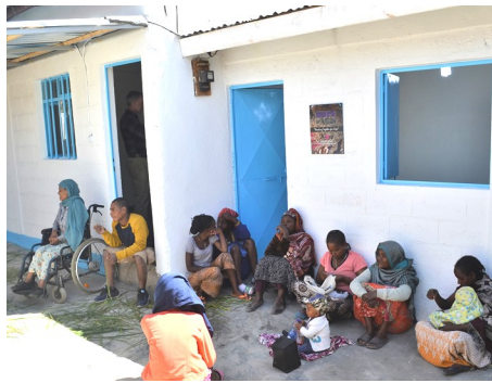
Families visiting the NEW Clinic

From its small beginnings as a backpack service, the health services of Hope for Korah now employs 3 local, full-time health staff and numerous others in support. Along the way, many foreign and local health professionals, along with Ethiopian government officials, have contributed their perspective and expertise on what kind of health service would best serve this community in helping families to break the cycle of poverty. Collectively, it was determined that a Primary Health Clinic focused on the prevention of disease would be our unique focus (though not our only emphasis), allowing us to build the capacity of families to attain and maintain health.