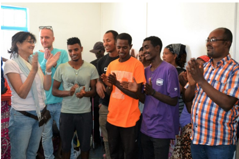
Thank you to those who renovated the clinic.

It is hard to imagine, living in in a "first world" context, the reality of so many being disabled or dying from completely preventative diseases and traumas we rarely see here, because we HAVE. But such IS the case in Korah. Too many children, mothers, siblings, fathers, friends losing their lives or their productivity far too early. Many we have held, played with, and prayed over. They are not statistics, but people with names, abilities and families who love them. With each loss, the dream to open a legalized clinic has grown.