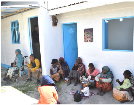
Families visiting the NEW Clinic

From its small beginnings as a backpack service, the health services of Hope for Korah now employs 3 local, full-time health staff and numerous others in support. Along the way, many foreign and local health professionals, along with Ethiopian government officials, have contributed their perspective and expertise on what kind of health service would best serve this community in helping families to break the cycle of poverty. Collectively, it was determined that a Primary Health Clinic focused on the prevention of disease would be our unique focus (though not our only emphasis), allowing us to build the capacity of families to attain and maintain health.