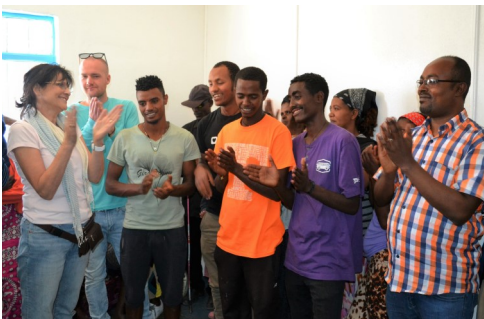
Thank you to those who renovated the clinic.

It is hard to imagine, living in a "first world" context, the reality of so many being disabled or dying from completely preventative diseases and traumas we rarely see here, because we HAVE. But such IS the case in Korah. Too many children, mothers, siblings, fathers, friends losing their lives or their productivity far too early. Many we have held, played with, and prayed over. They are not statistics, but people with names, abilities and families who love them. With each loss, the dream to open a legalized clinic has grown.