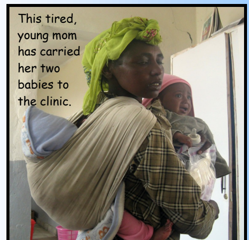
This tired, young mom has carried her two babies to the clinic.