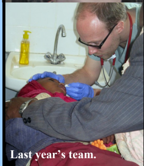
Last year's team.