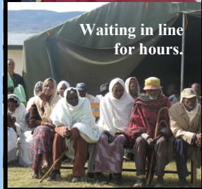
Waiting in line for hours.