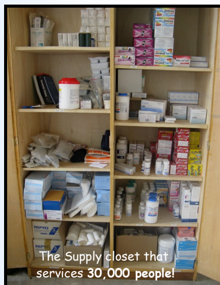
The Supply closet that services 30,000 people!

We are now, very excited to be going to Ethiopia in April 2010. Our group of 13, from varied fields, will be partnering with HOPE International Development Agency www.hope-international.com They will support us in volunteer preparation through administration, promotion and poverty alleviation and development education. Hope International has extensive experience in poverty alleviation, emergency response and development projects all over the world and we are thrilled to be partnering with them.