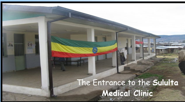
The Entrance to the Sululta Medical Clinic