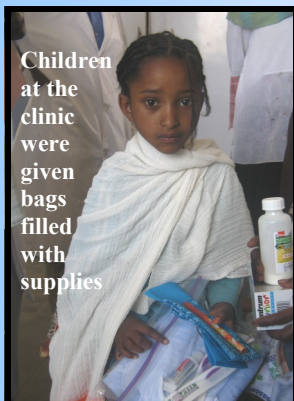
Children at the clinic were given bags filled with supplies