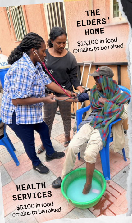
THE ELDERS' HOME $16,100 in food remains to be raised