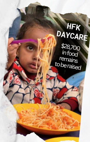
HFK DAYCARE $28,700 in food remains to be raised

With all of our programming providing some level of nutrition, our annual budget has significantly increased. Unfortunately, we expect even more food increases due to a poor crop season. Therefore, we are hoping that you would consider giving a gift to help any one of our programs. Thank you for coming alongside the poor in Korah!