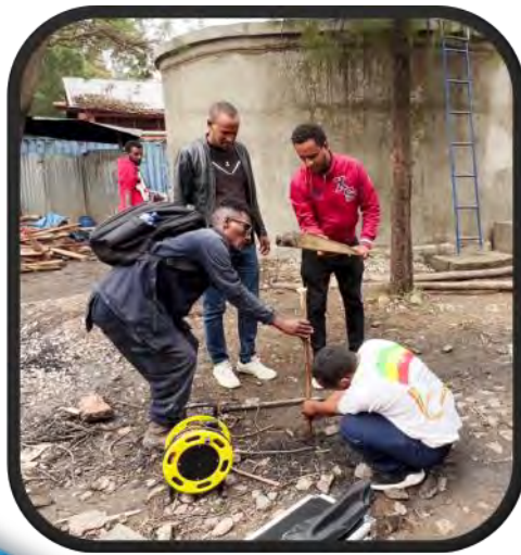
X marks the spot! Staking the ground. This is where we drill the well!