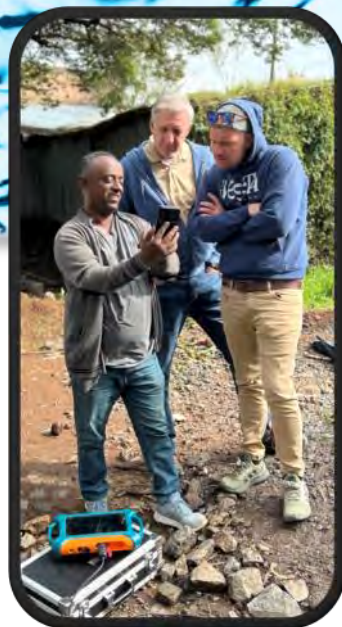
Patently waiting for survey results.

Why is this well so important? This school of over 5,000 students (K-8) and almost 400 staff have no on site water and rely on HFK to truck in 100,000 liters every week and that is only one third of the water they need. The demand will increase even further when the high school is built on the campus later this year. Thank you to all of you who helped to fund this project! You are making a very big difference in the lives of all the children and staff at Basilius.