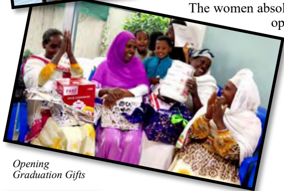
Opening Graduation Gifts