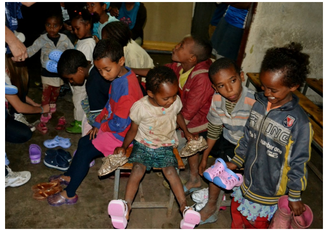
Trying on new shoes –a suitcase full!

We kicked off the program by sending out our first sponsorship information on August 6th to those people who had expressed interest in the program. By the time we left for Ethiopia on August 19th; we had 11 families sponsored! One week later - everyone was sponsored!! We are so very thankful for each of our sponsors and to God for His amazing provision. Most of these Korah families have already been moved into better shelters and they now have food to offer their children and themselves. They are no longer begging or eating at the trash dump! Instead they have a hope and a future; they are involved in weekly community meetings, bible study and their children are enrolled in school.