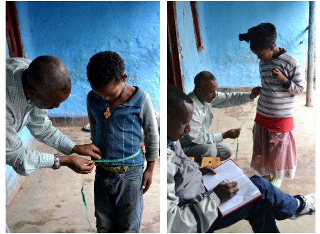
Children were enrolled in school, measured for uniforms & received back packs & supplies