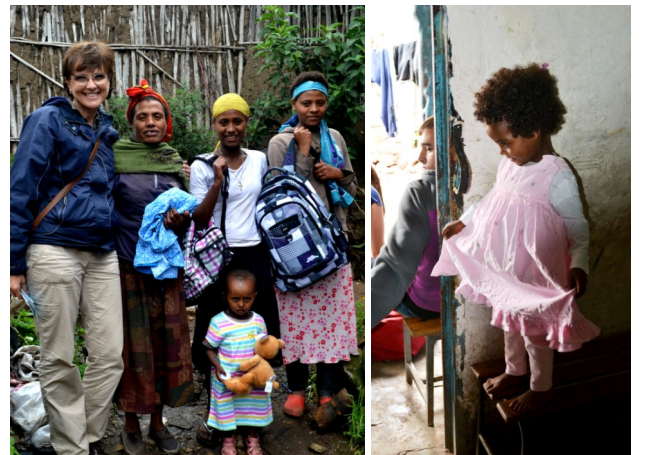
Many received new clothes