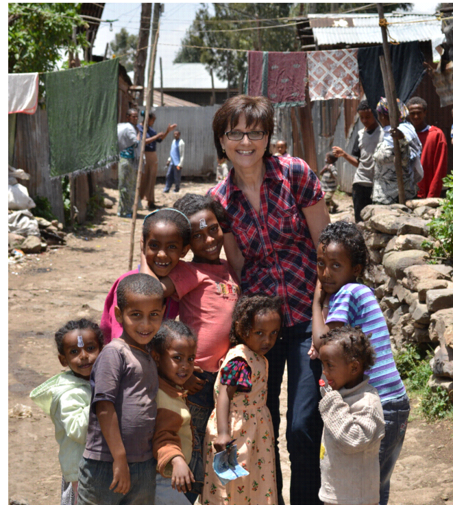
Children fill the streets of Korah, many are orphaned or have lost at least one parent.

IMMEDIATE NEEDS for the HFK August 2011 Missions Trip