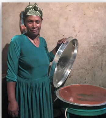
Several of our women have started making and selling injera at restaurants, stores & neighbours.