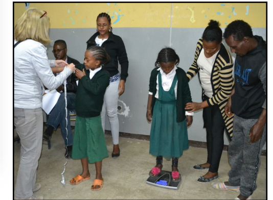
Measuring new children for intake assessment into 2nd Berta Program location.