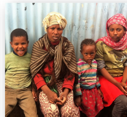
Tsehay Family of 4