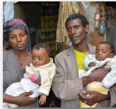
Meseret Family of 4