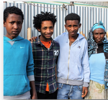
Birhane Family of 4