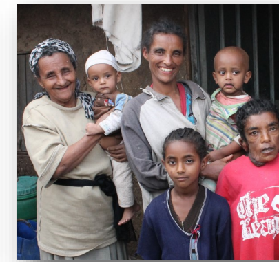
Senayet Family of 7