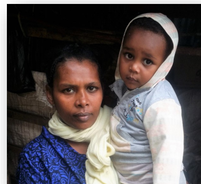
Tekea Family of 2