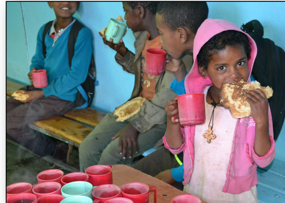
Serving Berta Pancakes to 275 children at our current Berta Breakfast compound.