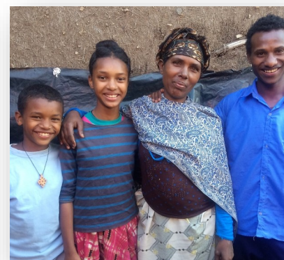
Etenesh Family of 4