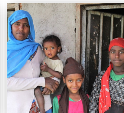
Zeritu Family of 4