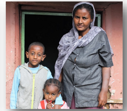
Hirut Family of 4