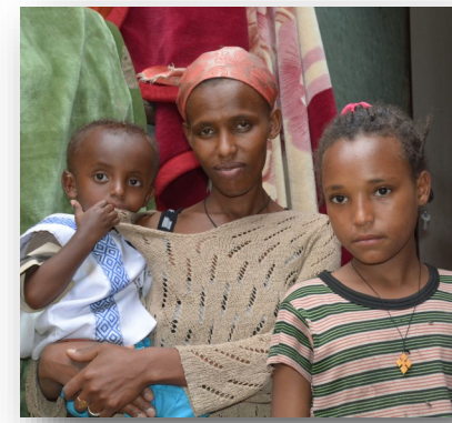
Lensa Family of 3