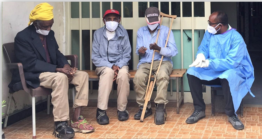
HFK's Health Officer teaches the Elders proper handwashing technique.