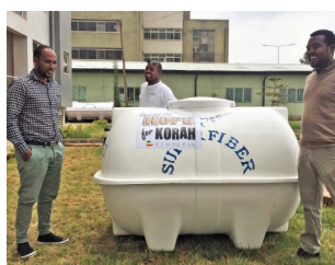
Due to the current water shortage in Korah, HFK has donated two 2,000gallon water tanks, one for each woreda (sub-city district) we serve.

Caring for basic needs is our top priority: this includes distributing two months' supply of soap, sanitary supplies, and groceries to all HFK families, orphans, and elders, ordering additional medical supplies and masks for all staff and beneficiaries and putting an emergency plan into place at our clinic. All HFK group activities and programs have been put on hold due to government restrictions, but all medical staff, caregivers and essential staff remain on duty.