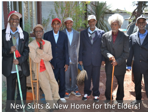
New Suits & New Home for the Elders!