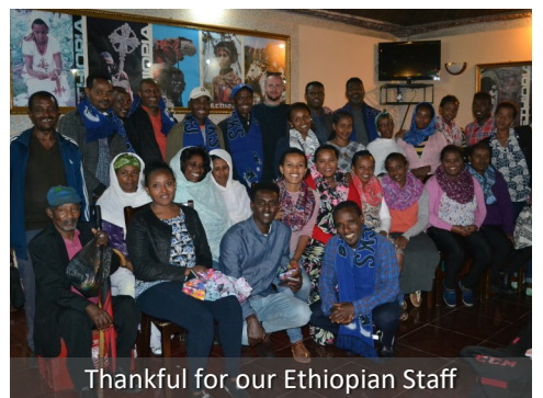
Thankful for our Ethiopian Staff