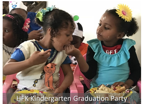
HFK Kindergarten Graduation Party