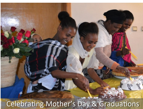
Celebrating Mother's Day & Graduations