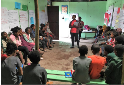
88 Students Attend 3 Day Life Skills training