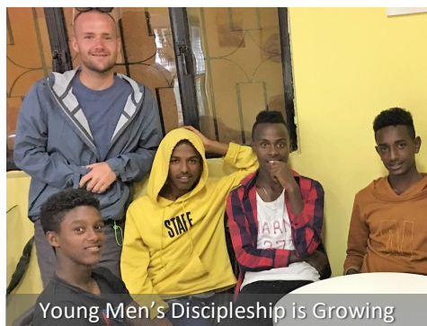
Young Men's Discipleship is Growing