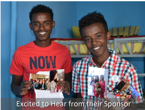
Excited to Hear from their Sponsor