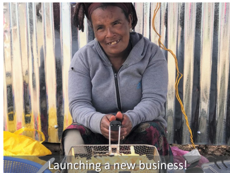
Launching a new business!