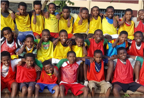
Soccer is Extremely Popular - 130+ Kids!

Loosening the yoke of extreme poverty in Korah, Ethiopia.