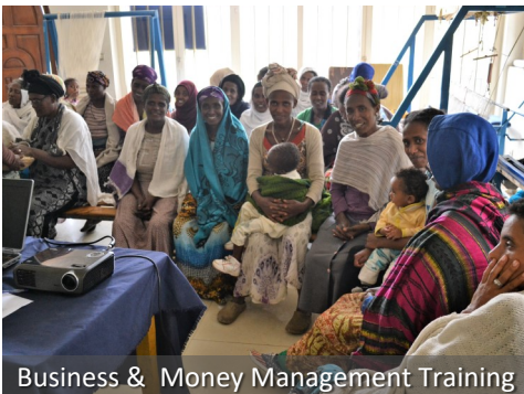
Business & Money Management Training