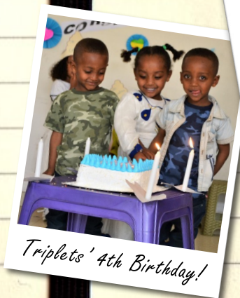
Triplets' 4th Birthday!

Our daycare provides peace of mind. It allows mothers to participate fully in income generation and employment opportunities, knowing that their child is being cared for in a safe and nurturing environment. Experienced nannies provide exceptional care, planned programming and play-based activities, nutritious snacks and a daily lunch. Pre-school aged children attend HFK's kindergarten where our qualified KG teacher gives lessons on early educational skills. The creative in hands-on learning.