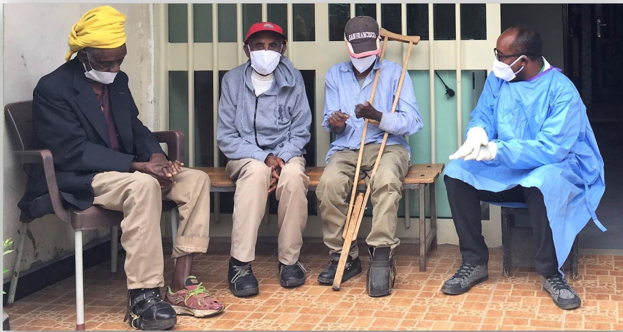
HFK's Health Officer teaches the Elders proper handwashing technique.