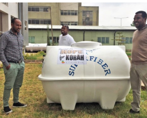
Due to the current water shortage in Korah, HFK has donated two 2,000 gallon water tanks, one for each woreda (sub-city district) we serve.

Therefore, we have been working to put emergency measures into place while receiving reports of soaring prices and food shortages. Many of our families survive day to day on meager incomes earned in jobs that have halted due to this crisis. Access to medical care is limited as hospitals and clinics prepare for Covid-19 patients, making prescriptions and needed medicines less accessible.